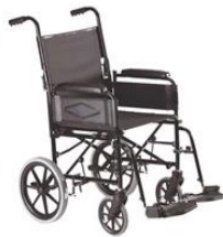
Wheelchair – push only

Wheelchair type that can be self-propelled or pushed. If self-propelled the user must be able to stay in an upright position and have enough strength in both arms to push yourselves. If you have heart problems, difficulty breathing, low or no vision, or suffer from seizures or blackouts a self-propelled wheelchair is not suitable, users must be at least 5 years old.